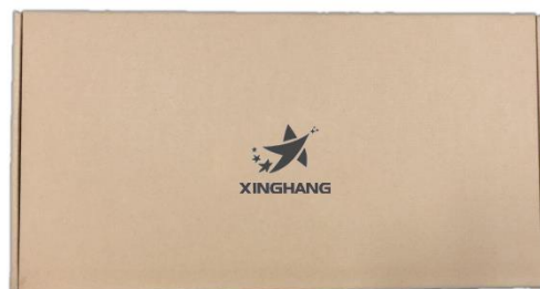
Figure 5-2 RHF2S208 package