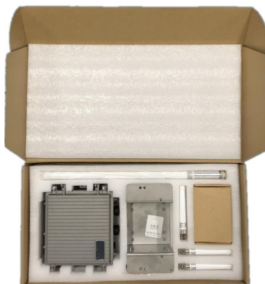
Figure 5-3 package inside